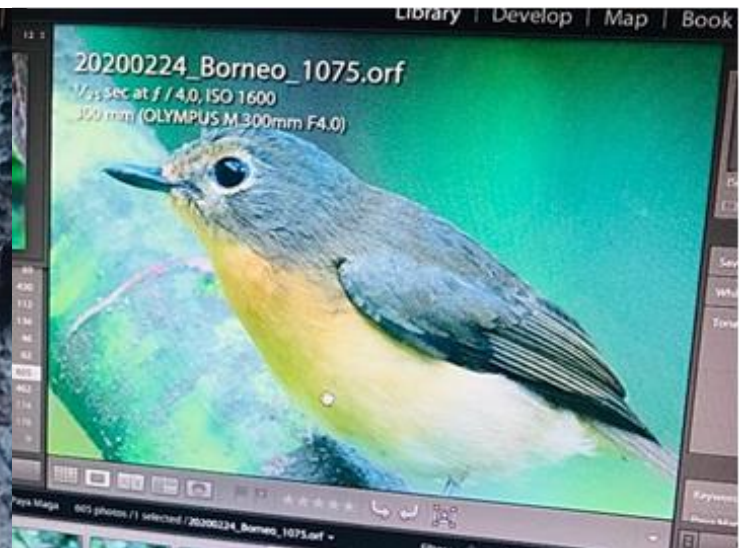
Dayak (Hill) Blue Flycatcher